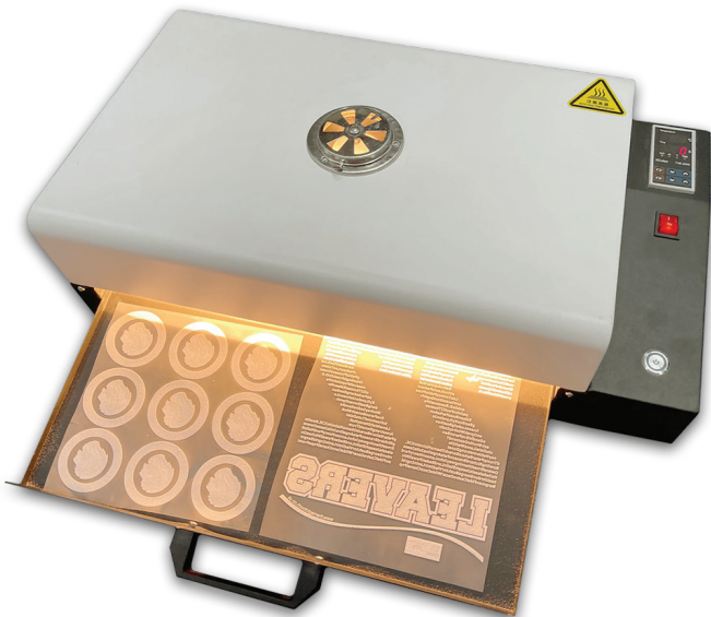
Manual Curing Oven

Whilst we attempt to give guidance on cost per transfer it's always been dependent on the image size, number of colours and what image is to be printed. However, the installed DTFMagic RIP enables every job to be accurately costed prior to printing, whether it be one or multiple images. A good example is a 60mm full colour round logo would cost less than 5p each!