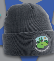
Caps & Hats