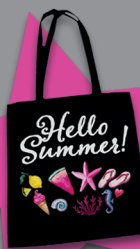
Bags & Holdalls