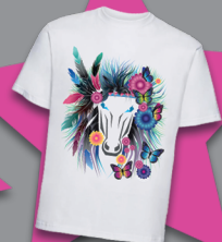
Cotton & Polyester