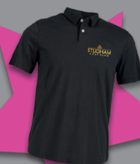
Pique & Wicked Fabrics